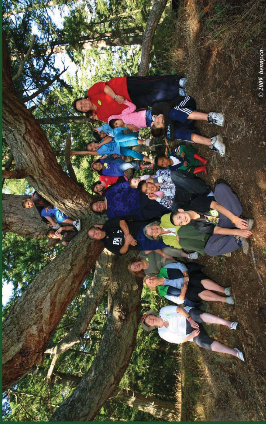
Grandparents Raising Grandchildren at the “Grandmother Tree”, Galiano Island

Partnering to Build Resilience in Youth and Communities through Nature